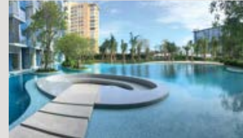
BLU ( CHA AM - HUA HIN )