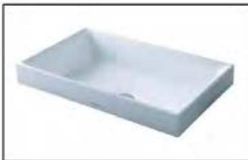
Wash Basin: TOTO รุ่น L1716 ล้างล้างหน้า Console Lavatory ขนาด 600 x 385 x 65 mm.