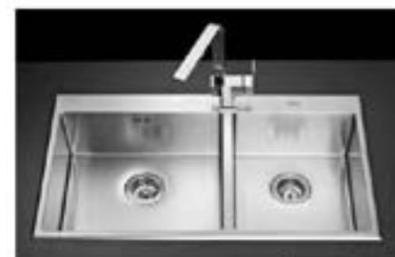
Sink + Tab