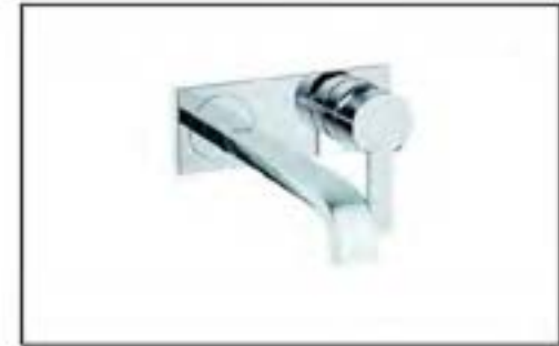
Basin Faucet: Grohe รุ่น 19386000