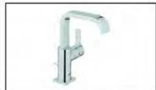
Basin Faucet: Grohe รุ่น 32146000 M-Size Basin Mixer