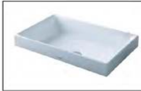
Wash Basin: TOTO รุ่น L1716 อ่างล้างหน้า Console Lavatory ขนาด 600 x 385 x 65 mm.