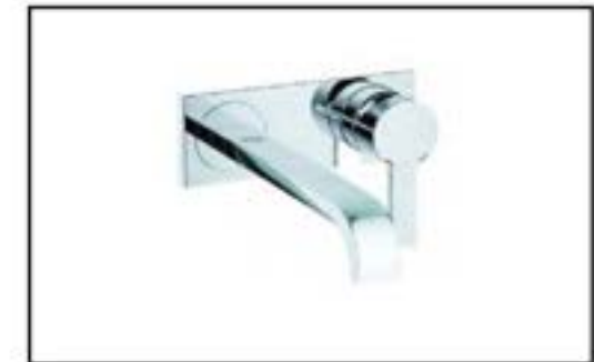
Basin Faucet : Grohe รุ่น 19386000