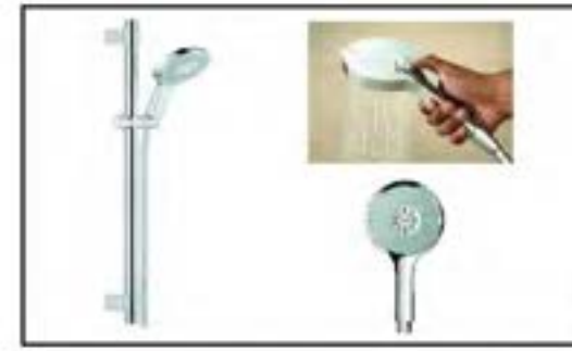
Hand Shower: Grohe รุ่น 27734000