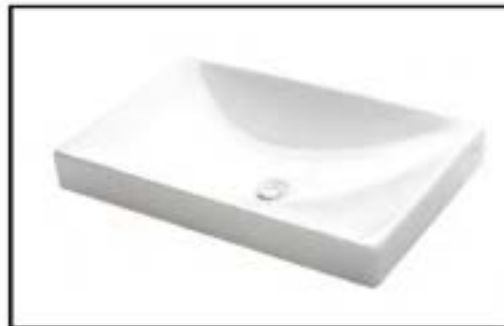
Wash Basin : TOTO รุ่น LW645JW/F-1 อ่างล้างหน้า Console Lavatory ขนาด 660 x 420 x 75 mm.