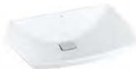
Wash Basin: TOTO รุ่น LW682 อ่างล้างหน้าฝังบนเคาน์เตอร์ Jewelhex ขนาด 685 x 490 mm.