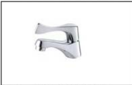
Basin Faucet : COTTO รุ่น CT164C1(HM)