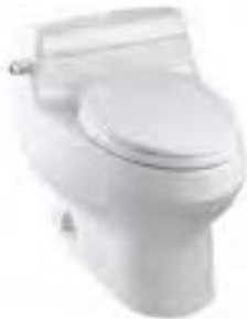
Water Closet: TOTO รุ่น CW688U โถสุขภัณฑ์ One Piece Toilet (Tornado Flushing, Cefiontect Coating) with seat & cover