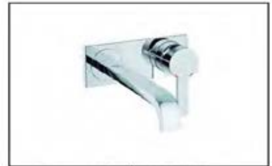
Basin Faucet: Grohe รุ่น 19386000