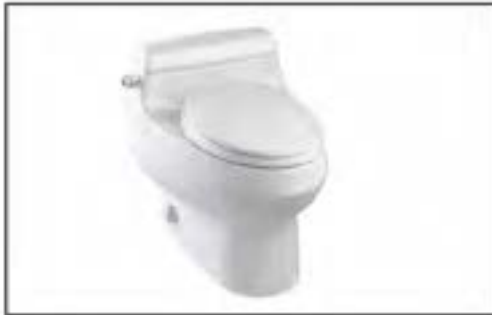
Water Closet: TOTO รุ่น CW688U โถสุขภัณฑ์ One Piece Toilet (Tornado Flushing, Cefiontect Coating) with seat & cover