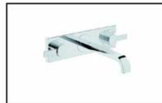
Basin Faucet: Grohe รุ่น 20193000