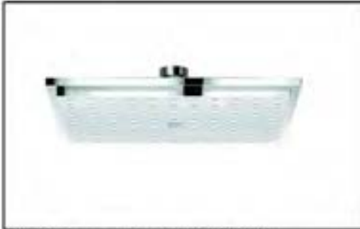
Rain Shower: Grohe รุ่น 27479000