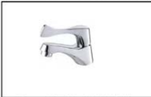
Basin Faucet: COTTO รุ่น CT164C1(HM)