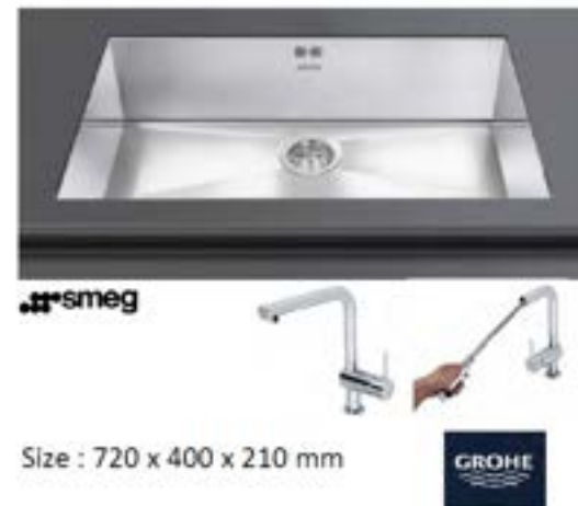
Sink + Tap