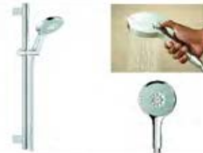
Hand Shower: Grohe รุ่น 27734000