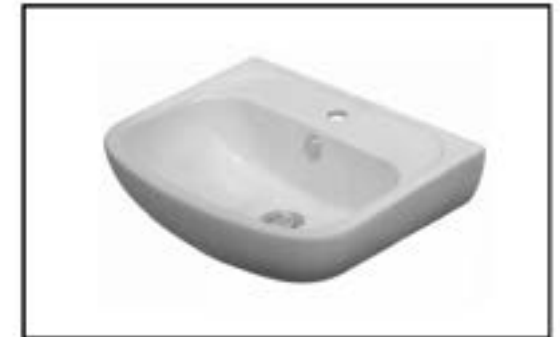
Wash Basin : COTTO รุ่น C0141 อ่างล้างหน้าแบบแขวนผนัง รุ่น นริโซ สีขาว