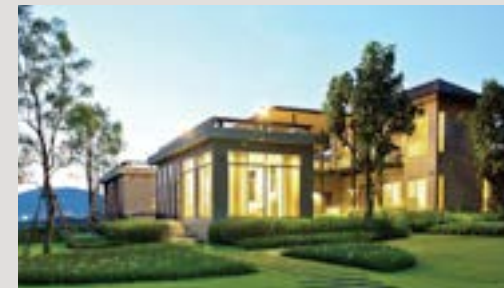
BAAN SITA WAN ( PAKCHONG )