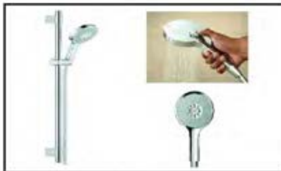
Hand Shower: Grohe รุ่น 27734000