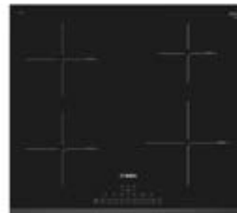
Induction Hob *