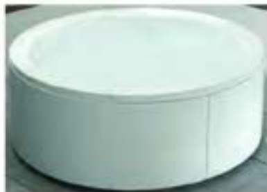
Bathtub: KASCH รุ่น OTTO - CO ขนาด 1500 x 1500 mm.