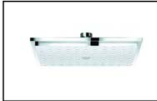
Rain Shower : Grohe รุ่น 27479000 Allure 230 Head shower 1 spray