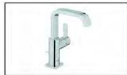
Basin Faucet: Grohe รุ่น 32146000 M-Size Basin Mixer