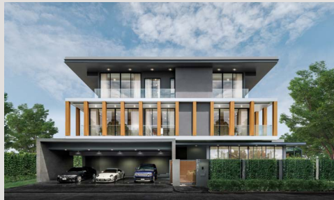
BAAN ISSARA ( BANGNA )