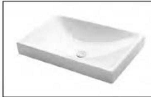
Wash Basin: TOTO รุ่น LW645JW/F-1 อ่างล้างหน้า Console Lavatory ขนาด 660 x 420 x 75 mm.