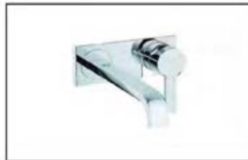
Basin Faucet: Grohe รุ่น 19386000