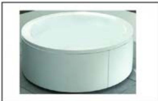
Bathtub: KASCH รุ่น OTTO - CO ขนาด 1500 x 1500 mm.