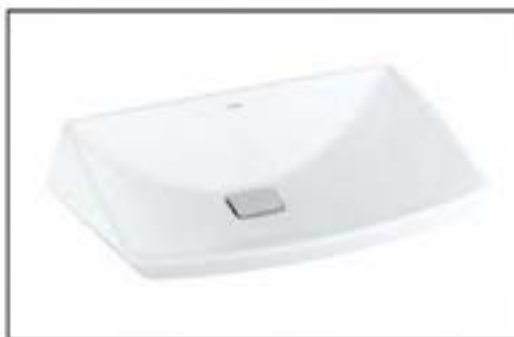
Wash Basin: TOTO รุ่น LW682 อ่างล้างหน้าฝังบนเคาน์เตอร์ Jewelhex ขนาด 685 x 490 mm.