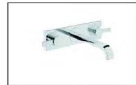
Basin Faucet: Grohe รุ่น 20193000