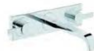
Basin Faucet: Grohe รุ่น 20193000