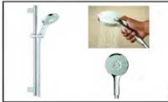
Hand Shower: Grohe รุ่น 27734000