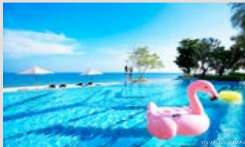
BABA BEACH CLUB HOTEL ( HUA HIN )