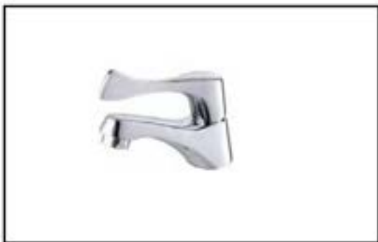
Basin Faucet : COTTO รุ่น CT164C1(HM)