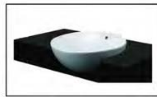
Wash Basin: TOTO รุ่น LW533JW/F อ่างล้างหน้า Semi Recessed Lavatory ขนาด 430W x 430D mm.