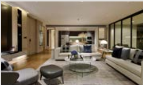
ISSARA COLLECTION ( SATHORN )