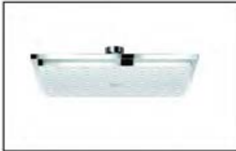
Rain Shower: Grohe รุ่น 27479000