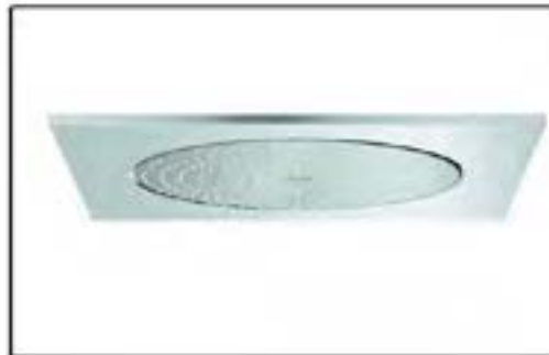
Rain Shower: Grohe รุ่น 27286000 F-Series 20" - ขนาด 508mm x 508mm