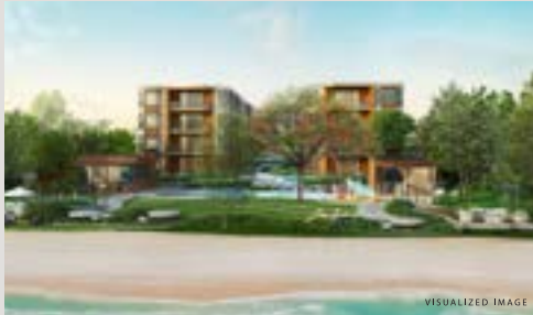
SASARA ( HUA HIN )