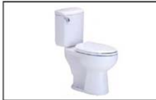
Water Closet : COTTO รุ่น C1302