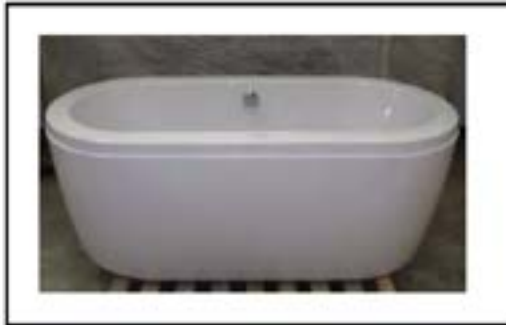
Bathtub: KASCH รุ่น SELECT-H ขนาด 1700 x 800 mm.