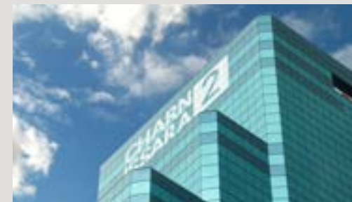
CHARN ISSARA TOWER II ( BANGKOK )