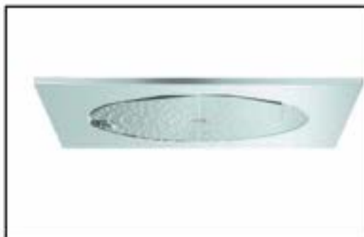
Rain Shower: Grohe รุ่น 27286000 F-Series 20" - ขนาด 508mm x 508mm