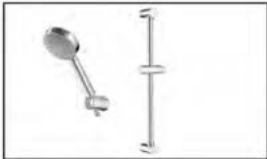
Shower: COTTO รุ่น Z71(HM) ฝักบัวพร้อมสาย 1 ฟังก์ชัน พร้อมราวแขวนฝักบัวปรับระดับ รุ่น CT709(HM)