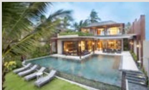
BABA BEACH CLUB ( NATAI )