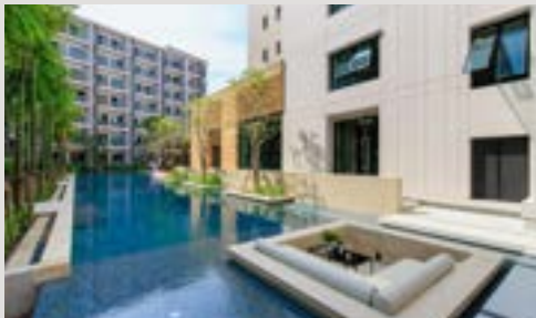
THE ISSARA ( CHIANG MAI )