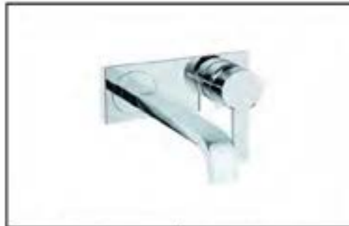
Basin Faucet: Grohe รุ่น 19386000

อ่างล้างหน้า Console Lavatory ขนาด 600 x 385 x 65 mm.