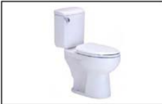
Water Closet : COTTO รุ่น C1302