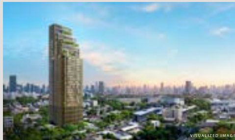
THE ISSARA ( SATHORN )