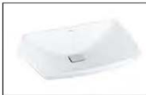
Wash Basin: TOTO รุ่น LW682 อ่างล้างหน้าฝังบนเคาน์เตอร์ Jewelhex ขนาด 685 x 490 mm.