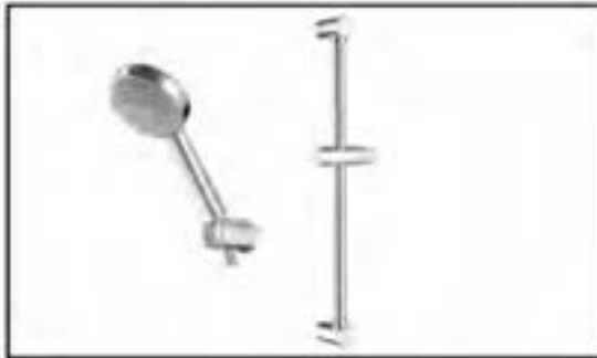
Shower: COTTO รุ่น Z71(HM) ฝักบัวพร้อมสาย 1 ฟังก์ชัน พร้อมราวแขวนฝักบัวปรับระดับ รุ่น CT709(HM)