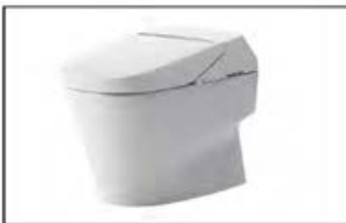
Water Closet: TOTO รุ่น CES992VA โถสุขภัณฑ์ NEOREST XH I