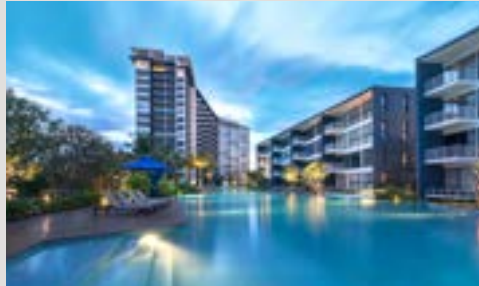
BAAN THEW TALAY BLUE SAPPHIRE ( CHA AM - HUA HIN )