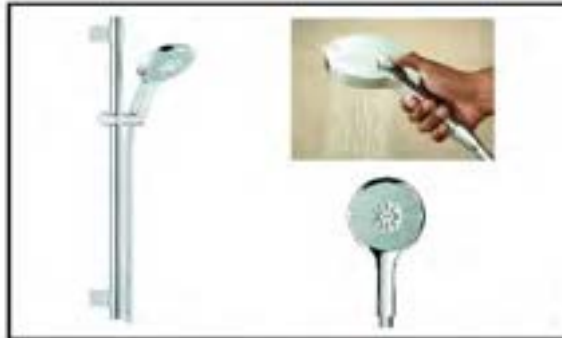
Hand Shower: Grohe รุ่น 27734000