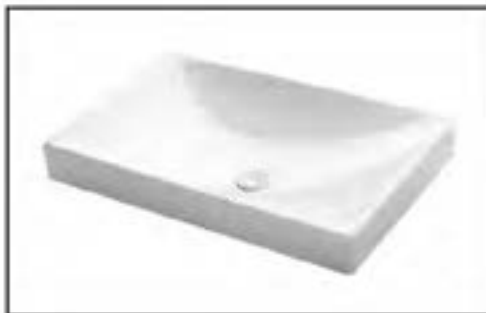
Wash Basin: TOTO รุ่น LW645JW/F-1 อ่างล้างหน้า Console Lavatory ขนาด 660 x 420 x 75 mm.