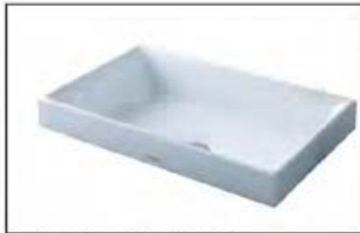
Wash Basin: TOTO รุ่น L1716 อ่างล้างหน้า Console Lavatory ขนาด 600 x 385 x 65 mm.