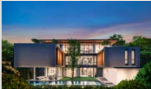
ISSARA RESIDENCE ( RAMA 9 )