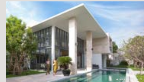
BABA BEACH CLUB ( HUA HIN )