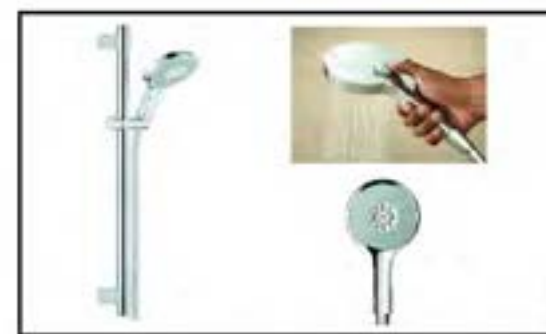
Hand Shower: Grohe รุ่น 27734000