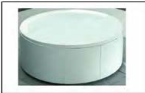
Bathtub: KASCH รุ่น OTTO - CO ขนาด 1500 x 1500 mm.