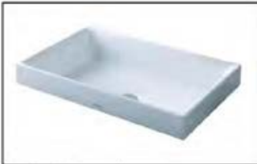
Wash Basin: TOTO รุ่น L1716

โถสุขภัณฑ์ One Piece Toilet (Tornado Flushing, Cefiontect Coating) with seat & cover