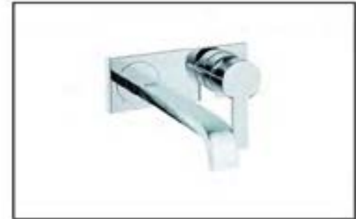
Basin Faucet: Grohe รุ่น 19386000