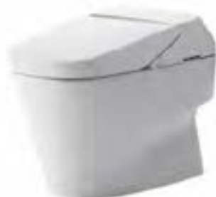
Water Closet: TOTO รุ่น CES992VA โถสุขภัณฑ์ NEOREST XH I