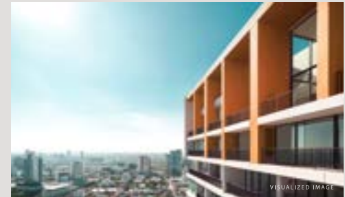
THE ISSARA ( LADPRAO )