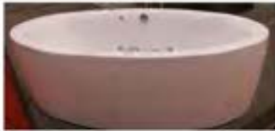
Bathtub: KASCH รุ่น CUTE FREESTAND ขนาด 1900 x 1000 mm.