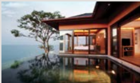
SRI PANWA ( PHUKET )