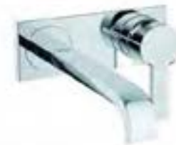
Basin Faucet: Grohe รุ่น 19386000