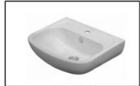
Wash Basin: COTTO รุ่น C0141 อ่างล้างหน้าแบบแขวนผนัง รุ่น บริโธ สีขาว