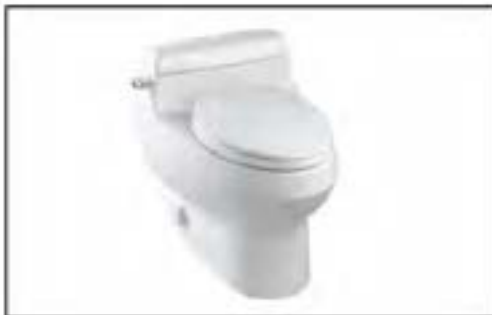
Water Closet: TOTO รุ่น CW688U โถสุขภัณฑ์ One Piece Toilet (Tornado Flushing, Cefiontect Coating) with seat & cover