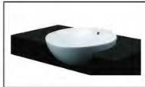
Wash Basin: TOTO รุ่น LW533JW/F อ่างล้างหน้า Semi Recessed Lavatory ขนาด 430W x 430D mm.