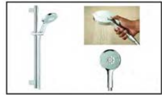
Hand Shower: Grohe รุ่น 27734000