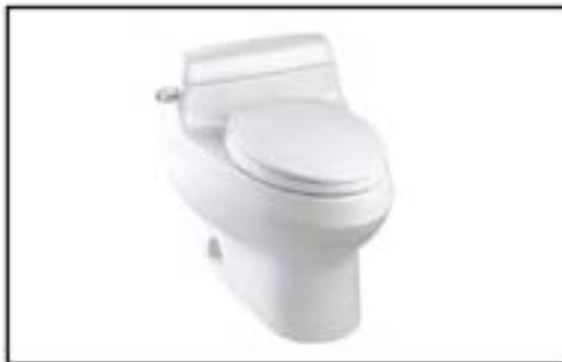
Water Closet : TOTO รุ่น CW688U โถสุขภัณฑ์ One Piece Toilet (Tornado Flushing , Cefiontect Coating) with seat & cover