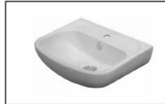
Wash Basin : COTTO รุ่น C0141 อ่างล้างหน้าแบบแขวนผนัง รุ่น บริโอ สีขาว