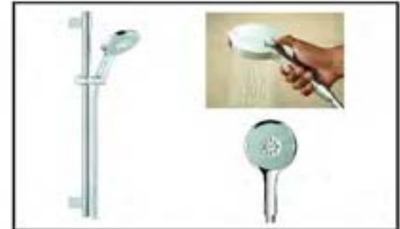
Hand Shower: Grohe รุ่น 27734000