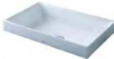
Wash Basin: TOTO รุ่น L1716 อ่างล้างหน้า Console Lavatory ขนาด 600 x 385 x 65 mm.