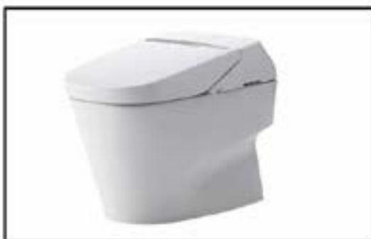
Water Closet: TOTO รุ่น CES992VA โถสุขภัณฑ์ NEOREST XH I