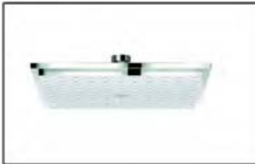
Rain Shower: Grohe รุ่น 27479000 Allure 230 Head shower 1 spray