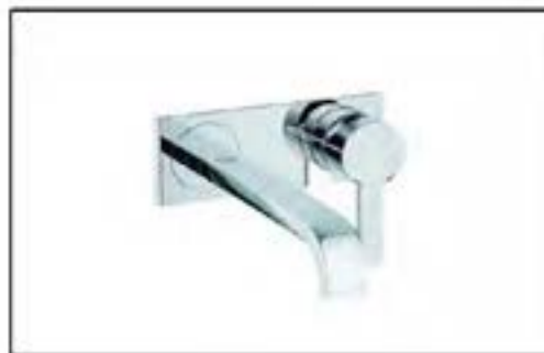
Basin Faucet: Grohe รุ่น 19386000